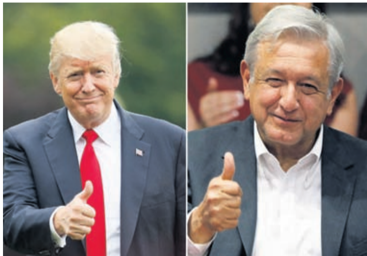
cotrafico na Latino America. Lopez Obrador, di e partido di isquierda Movimiento Re-

"Tin permanente cooperacion cu Gobierno di Merca, un bon relacion cune y cu presidente Trump", e mandatario a bisa den un conferencia di prensa ora el a ser cuestiona riba e anuncio di e Ehecutivo Mericano di 'duplica' e lucha contra e nar-